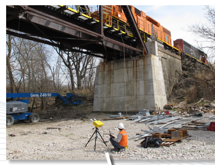
IBIS-FS monitoring an iron bridge